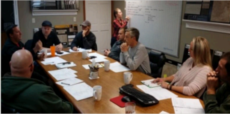
Top: Meeting with Contractors on how we can all improve