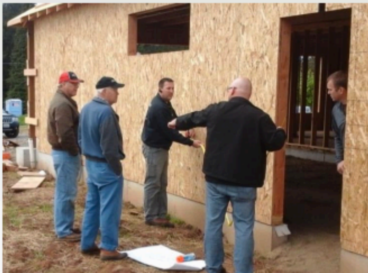
Left: On site meeting to decide where propane tank will be