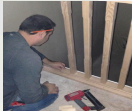
Detailed craftsmanship by one of our finish carpenters