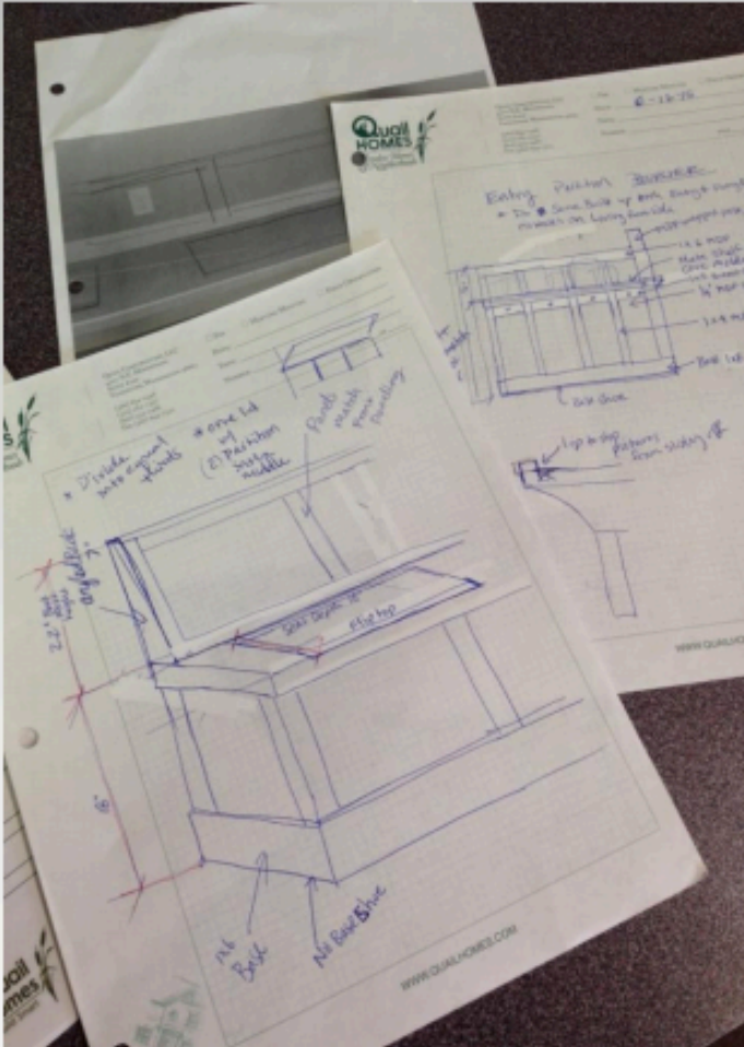
Millwork sketches to convey scope of work to finish carpenter